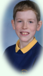
John Brookdale Child of Merit Award