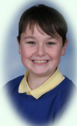
Caleb Creative Arts Award