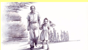
click for story

We celebrated Black History Month in assembly on Tuesday and have followed this up with work in our classes. We listened to this story and thought about the content of Dr Martin Luther King's speech and how it brought hope to the crowds. You can watch the story and the speech and home by clicking on the images below: