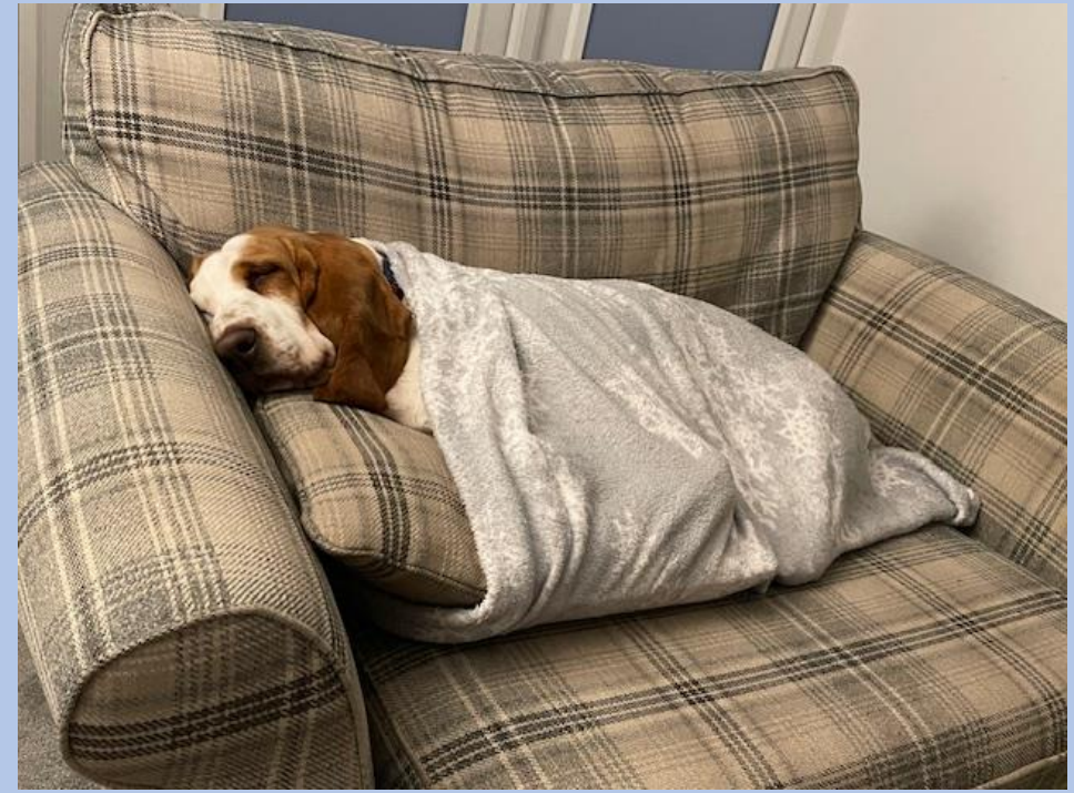
Duncan – Our school dog