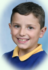
Henry Creative Arts Award